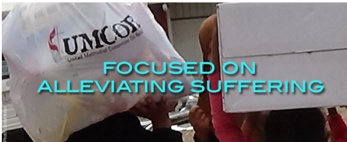
UMCOR joined with GlobalMedic to provide staples to refugees in northern Iraq.

If you have more questions on this topic, contact www.umc.org/resources/infoserv and they will put you in touch with the appropriate church contact.