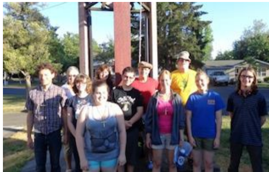
Forest Grove Team Helped All 4 Days - Thank you