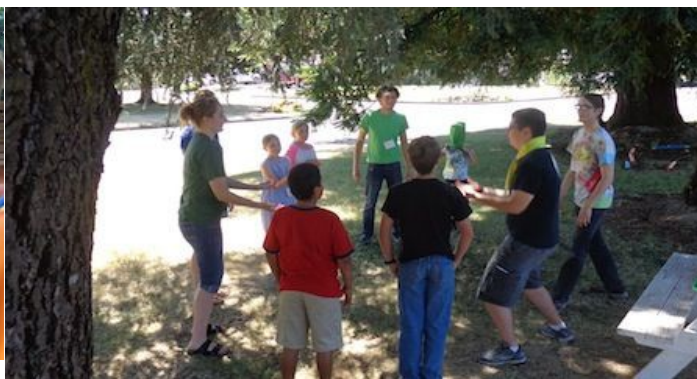
Outdoor Games - a highlight